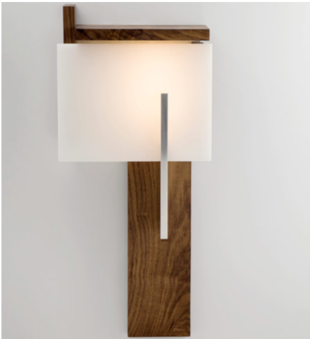
Shown in: Brushed Aluminum / Oiled Walnut

The Oris Wall Sconce has a strong and commanding presence with the thick solid stock walnut and aluminum fin that gives the feeling of permanence and integration into the surrounding area. Available with an Oiled Walnut or Dark Stained Walnut finish and Brushed Aluminum accents complemented by a frosted polymer diffuser. 2700K and 3500K color temperature options available. UL and cUL listed. ADA compliant. Made in the USA. Prop 65.