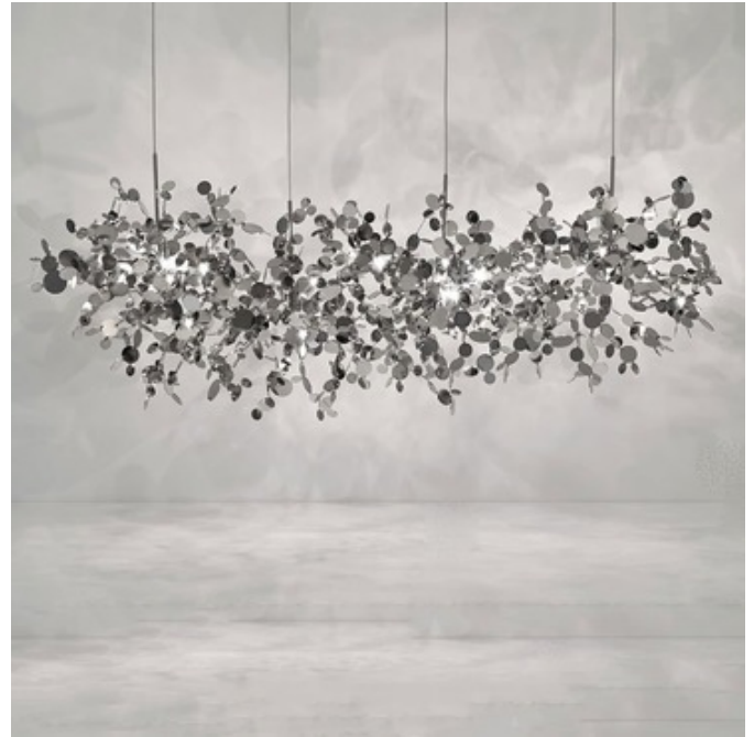
Shown in: Nickel / Stainless Steel

The Argent Linear Suspension creates a shimmering cloud of metal discs that have been meticulously shaped by hand by Terzani craftsmen into clusters of beauty. Once lit, the multiple, angled surfaces of the discs emanate a soft shimmering glow