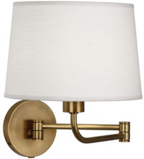
Shown in: Aged Brass / Oyster Linen

The Koleman Swing Arm Wall Light features an Oyster Linen shade with an Aged Brass, Deep Patina Bronze, or Polished Nickel finish. Includes optional plug and cord kit with cord cover, so fixture can either be direct wired or plugged into the wall. Includes hi-lo switch. UL listed.