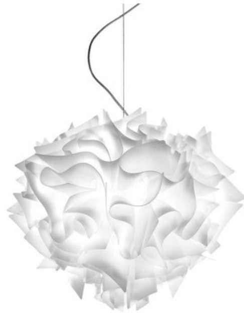
Shown in: Chrome / Opal

The Veli Suspension, designed by Adriano Rachele is like a tailor-made dress. This piece is assembled entirely by hand. When installed it gently clothes and amplifies light through the Opal, Plum, Charcoal, or Prism Opalflex. Product is magnetic allowing easy removal for cleaning. Dome canopy in Chrome with transparent wire.