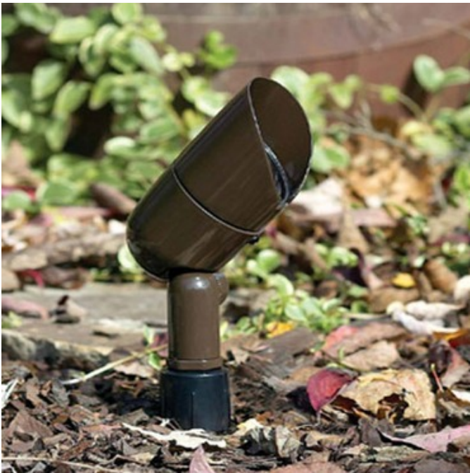
Shown in: Bronze

BL5016 7 Watt 24 or 36 Degree Narrow Flood LED Aluminum Bullyte with Mounting Stake is fabricated from die cast marine grade aluminum alloy with fully adjustable swivel arm with vibration proof locking teeth and fully adjustable double gasketed shroud. Thermoset polyester powdercoat finish in Black or Bronze. Clear tempered glass affixed at 10 degree angle for natural cleaning. Includes 1.4 inch diameter x 9.5 inch length S7 PVC stake with integral .5 inch NPS fitter. Optional junction box accessories available, sold separately. One 7 watt 24 degree beam angle GU5.3 MR16 EnduraLED lamp included. Available with 3000K Warm White color temperature. Available in a 24 degree narrow flood beam spread option. Pre-wired with 3 foot pigtail of 18-2 AWG wire. Includes low voltage quick connector LVC3 for easy hook up to the low voltage supply cable not included. 2.8 inch diameter x 5.8 inches long. ETL listed for wet locations. Note: Required remote transformer and optional mounting accessories sold separately.