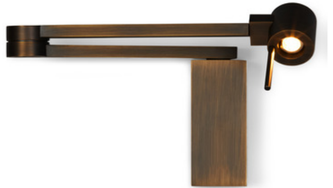
Shown in: Satin Bronze / Bronze

Manhattan Reading Swing Arm Wall Light features a double jointed arm that moves both on the axis of the base and on the joint between the two arms. Adjustable head. Available with or without a switch on the backplate. Note: This fixture does not mount to a standard US junction box - a 2 x 4 junction box is required.