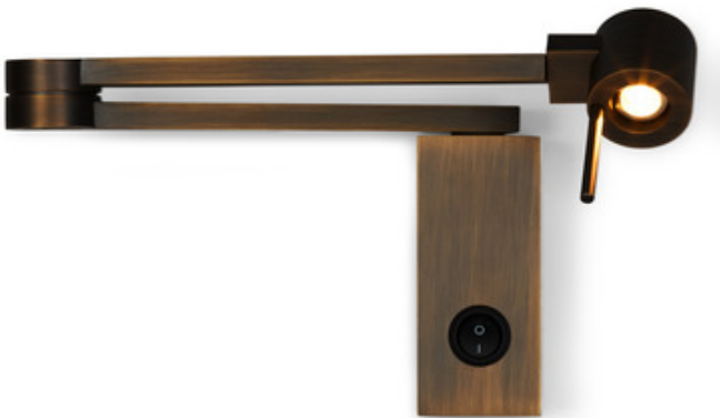
Shown in: Satin Bronze / Bronze

Manhattan Reading Swing Arm Wall Light features a double jointed arm that moves both on the axis of the base and on the joint between the two arms. Adjustable head. Available with or without a switch on the backplate. Note: This fixture does not mount to a standard US junction box - a 2 x 4 junction box is required.