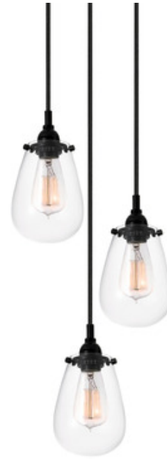
Shown in: Satin Black / Clear

The Chelsea Multi Light Pendant features voluminous Clear glass shades paired with industrial-style sockets.