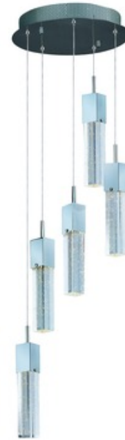
Shown in: Polished Chrome / Etched Bubble

The Fizz III LED Pendant features individual pendants that can be hung in a variety of configurations to achieve desired look.