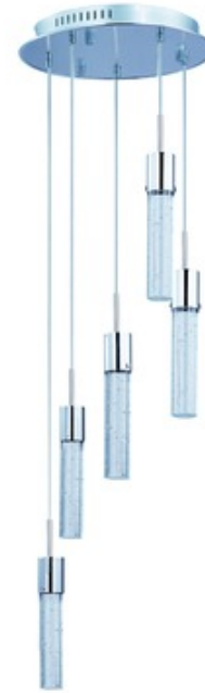
Shown in: Polished Chrome / Clear

Fizz IV Pendant features an etched bubble glass shade in a polished chrome finish, available in a 5-light or 9-light versions. Either (5) or (9) 7.5-watt, 120 volt LED lamps come included. Lamp color temperature is 3300K. Dry Rated. Dimensions: 5-light: 14W x 14H. 9-light: 16W x 14H.