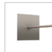
2.8" Square Canopy