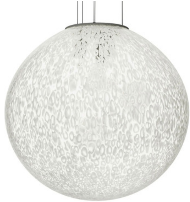
Shown in: Nickel / White

The Rina Pendant was inspired by the dandelion flower and uses the traditional murrina technique that creates a light, organic texture. Rina features White Murrina glass with a Nickel finish.