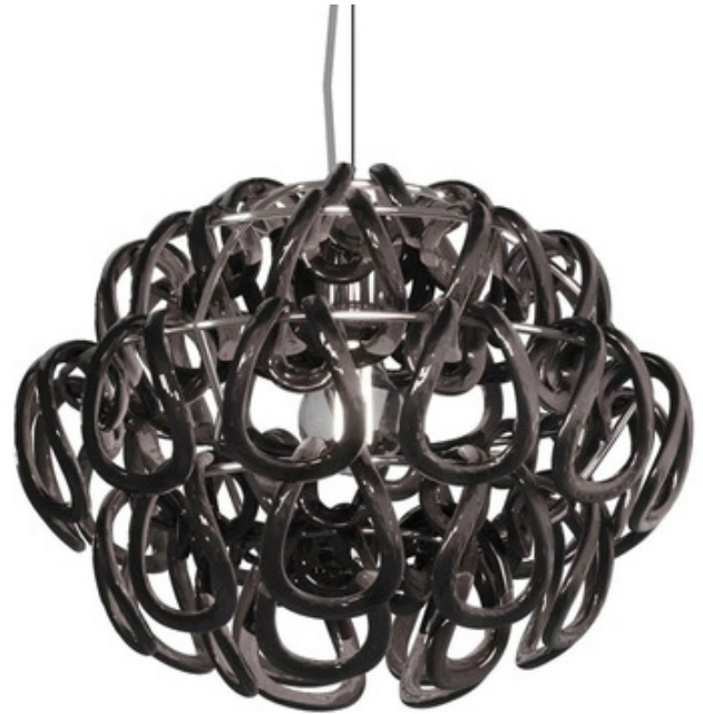
Shown in: Chrome / Black

Originally conceived in 1967 by Angelo Mangiarotti, the Giogali Pendant derives both its name and shape from the Italian word giongher, referring to the rope used to tie a horse or ox-driven cart to the yoke. The pendant is composed of a multitude of small, rope-like crystal hooks, which are linked together to form a net of glistening glass. The crystal is draped around the light's frame, obscuring the light source and creating a gleaming cascade of light. With its delicate and glamorous aesthetic, Giogali will enhance any interior with an elegant sparkle. Note: Due to the weight of the fixture, the 25 and 33 inch pendants require additional ceiling support. The 14.5 inch pendant is only available with Black, White, or Transparent shade color and Chrome finish.