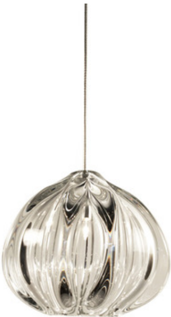
Shown in: Satin Nickel / Clear

The Barnacle Urchin Pendant focuses on the way glass forms and light play with each other. Hand-rendered texture creates unique projected patterns on the urchin and barnacle lights. These low voltage fixtures can be hung singularly from a monopoint canopy or as a grouping for a statement piece. Hand-blown and shaped in lead free crystal. No molds are used, and each glass shape is unique. Canopy required and sold separately. Includes male FreeJack connector.