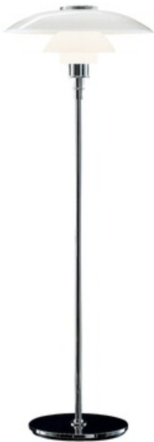
Shown in: Chrome / Opal

PH 4 1/2 - 3 1/2 Glass Floor Lamp, designed by Poul Henningsen, is based on the principle of a reflective three shade system, which directs the majority of the light downwards. The shades are made of hand-blown opal three layer glass, which is glossy on top and sandblasted matte on the underside, giving a soft light distribution. Available with Opal glass and a Chrome finish. Includes 108 inch black cord with inline on / off switch.