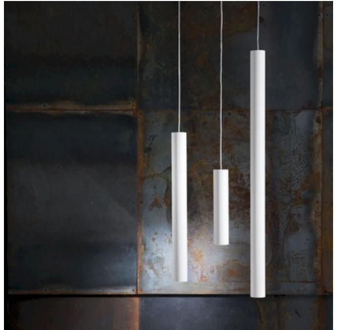
Shown in: Matte White

A-Tube Pendant designed by the Studio Italia Design Team, is reminiscent of a precious pin with a transparent glass detail on the end that shines like morning dew in spring. Perfect for minimalist spaces when used individually and a lighting masterpiece when grouped together at varying heights. Comes with 10 feet of cable to customize length, and a Matte White canopy. CE listed. ETL listed.