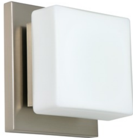
Shown in: Satin Nickel / No Glass

The Alex Wall Light features assorted glass trim options with a Bronze or Satin Nickel finish. Also comes with no glass trim. 50 watt, 120 volt JCD G9 base bulbs are required but not included. With Glass: 6.325 inch width x 6.325 inch height x 3.375 inch depth. Without Glass: 4.375 inch width x 4.375 inch height x 3.25 inch depth. ADA compliant. UL listed. Suitable for interior damp locations.