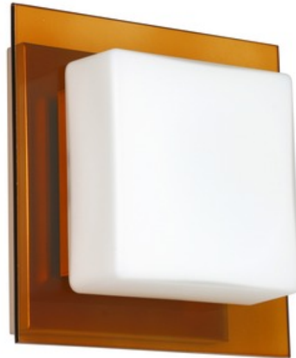
Shown in: Satin Nickel / Armagnac Glossy

The Alex Wall Light features assorted glass trim options with a Bronze or Satin Nickel finish. Also comes with no glass trim. 50 watt, 120 volt JCD G9 base bulbs are required but not included. With Glass: 6.325 inch width x 6.325 inch height x 3.375 inch depth. Without Glass: 4.375 inch width x 4.375 inch height x 3.25 inch depth. ADA compliant. UL listed. Suitable for interior damp locations.