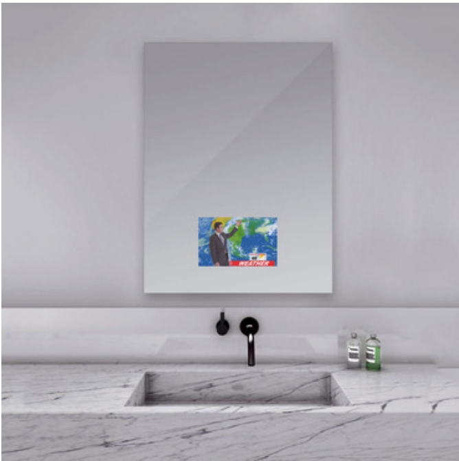
Shown in: Mirror

The Loft Mirror with 15 inch TV features a corrosion resistant OmegaMirror glass. Choice of a 21.5 or 15.6 inch LED HDTV with HDMI, RF and component connections. Integrated speakers for high quality stereo sound. Electric Mirror's Spectrum Mirror TVs are best suited for bathrooms that are not overly bright. When the TV is off, the screen area is camouflaged, leaving only a light gray image where the TV is located. Waterproof remote included. Available in four sizes. Note: The Loft TV mirror must be installed in the W x H (width x height) orientation as listed; it cannot be installed in any other direction.