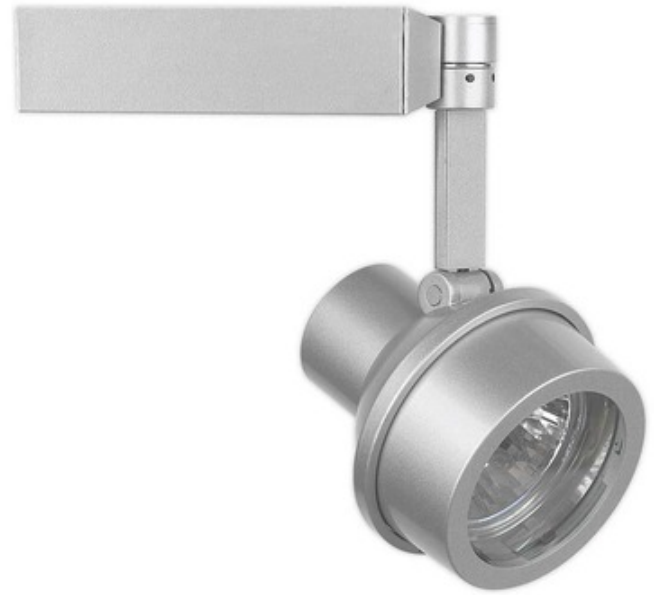
SHOWN IN METALLIC ALUMINUM

Alcyon Enclosed Step Spot MR16 track head features a wireless stem profile with infinite horizontal rotation and 0-90 degree vertical adjustment. Made of die-cast aluminum in Matte White, Matte Black or Metallic Aluminum finish. Includes 12 volt Class 2 compact electronic transformer inside molded polycarbonate housing and glass shield for use with unshielded lamps. One 50 watt, 12 volt GU5.3 MR16 halogen lamp is required, but not included. UL listed. 2.75 inch diameter x 2.75 inch depth x 4.75 inch length. Compatible with Lytespan Basic 1-circuit, Advent 1 or 2 circuit, and Radius 1-circuit track systems.