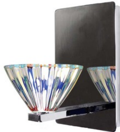
Shown with G518 Eden Dichroic Glass (Shade Sold Separately)

WS-MR58 Wall Sconce Bracket features a die-cast aluminum bracket and steel back plate available in Brushed Nickel, Chrome or Rubbed Bronze. Available with LED or halogen lamping. LED includes one 6 watt 3000K 85CRI LED, 305 lumens. 50,000 hour average lamp life. Halogen includes one 50 watt 12 volt GY6.35 halogen bi-pin lamp and 120 volt electronic transformer, 50/60Hz input, 12V AC/60W output. Halogen version dimmable to 10 percent with an electronic low voltage dimmer. UL listed. Dimensions: 4.9 inch width x 7.1 inch height x 4.1 inch depth. Requires shade and accommodates any 500 series glass shade under 6 inch in diameter, sold separately.