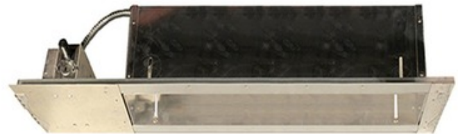
Shown in: Aluminum

Low Voltage Multiple Spot Series 3-Light Non-IC New Construction Housing is constructed of aluminum with galvanized steel frame, junction box and hanger bars. Non-IC designation requires that insulation be kept a minimum of 3 inches away from insulation. Supplied with 120 volt AC input transformer. Accommodates surface thickness of .50 to 1 inch. 5 3/16 x 13.25 inch cutout for flanged trim. 5 5/8 x 13.75 inch cutout for invisible trim. Available with LED or halogen lamp options. LED option includes three 12 volt GU5.3 MR16 lamps. Halogen option requires three 12 volt, up to 50 watt max GU5.3 MR16 lamps, but are not included. Note: A complete fixture requires a housing and trim, sold separately.