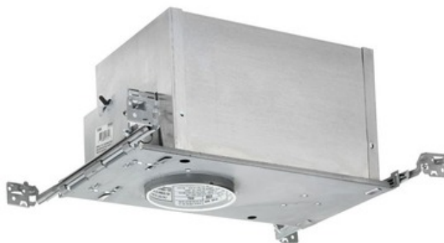
Shown in: Aluminum

IC44N 4 Inch Low Voltage Air Loc IC New Construction Housing is energy efficient with a sealed inner housing which does not require a separate ALG gasket. Air-Loc housing stops infiltration and exfiltration of air, reducing heating and cooling costs. Accommodates ceiling thickness up to 1 inch. Includes 120 volt to 12 volt 50VA thermally protected magnetic transformer mounted inside outer housing. One 12 volt, 50 watt GU5.3 MR16 halogen or LED equivalent lamp is required, but not included. May be dimmed using dimmers specifically designed for low voltage magnetic transformers. UL listed for through branch wiring, damp locations and IP. Trim 441, 4401, 4402 and 4481 are wet location approved for covered ceiling applications. 18.5 inch length x 9.1 inch width x 7.6 inch height. A complete fixture includes a housing and trim, sold separately.