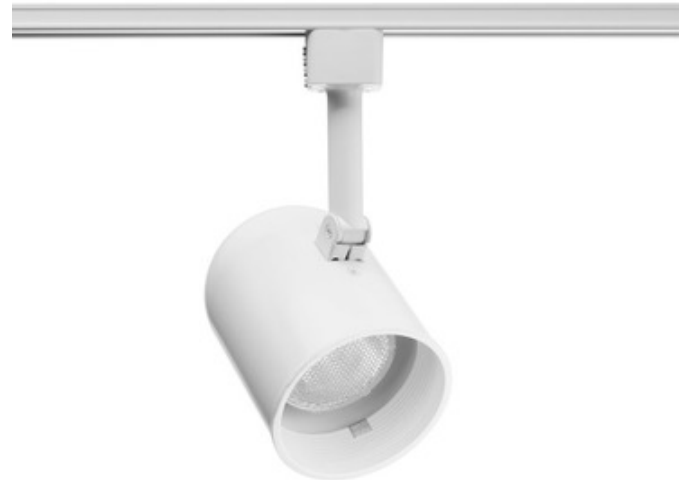
Shown in: White/ White Baffle

R501 PAR20 Round Back Cylinder Baffle Track Fixture features a drawn steel housing with polycarbonate stem available in White with a white baffle, Black with a white or black baffle, or Polished Brass or Bronze with a black baffle. 90 degree vertical aiming capability and 358 degree rotation. Copper alloy contacts provide precise spring action. True, positive electrical ground. On/off switch included. Patented embossed polarity arrows on bottom of adapter. Spring-loaded locking latch with embossed polarity arrows secures trac light to track. Pull-up contact to up position for use on two-circuit track. One 50 watt, 120 volt PAR20 or R20 medium base lamp is required, but not included. UL listed. Compatible with Juno Lighting Trac-Lites, Trac-Master 2-circuit and Trac-Master 2-circuit 120 volt line voltage track systems.