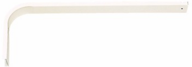
Shown in: White

Trac-Master outrigger bracket (non-electrified). For mounting track out from wall. Use two for 2, 4, or 6 foot track sections, three for 8 foot track sections and four for 12 foot track sections. Order track and connectors separately. For portable electrical feed use T22 or T122 Cord and Plug connector. For permanent wiring use T38 end feed connector. Finish available in White or Black. UL Listed.