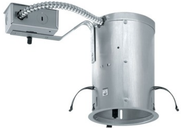
Shown in: Aluminum

TC20R 5 Inch Universal Non-IC Remodel Housing is for remodel application where back side of ceiling is not accessible. Installs through an opening in the ceiling from below. Secured in place by factory installed remodel springs. Accommodates ceiling thickness up to 1 1/8 inch. Design for use in non-insulated areas. If installed where insulation is present, the insulation must be pulled back 3 inches from all sides of the housing. One 120 volt, A19, BR30, PAR30, PAR20, R20, PAR30L or A15 medium base lamp or LED equivalent is required, but not included. Lamp type and wattage dependent upon housing/trim combination (see attached Juno manufacturer specification). Incandescent/halogen dimmable with a standard incandescent dimmer. Consult lamp manufacturer for dimmer compatibility when using an LED equivalent lamp. UL listed for through-branch wiring, damp locations and IP. Trims 210N, 211 and 212N are wet location approved for covered ceiling applications. Trims 215 and 216 are wet location approved for covered ceiling applications when used with outdoor rated lamps. 12.5 inch length x 5.9 inch width x 7.5 inch height. A complete fixture includes a housing and trim, sold separately.