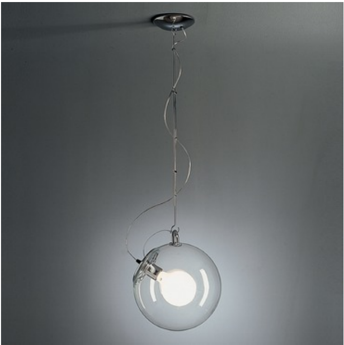
Shown in: Chrome / Clear

The Miconos Suspension features a hand-blown glass globe of light with a Polished Chrome or glam Gold finish. A design statement, Miconos is designed to complement both modern and more traditional interiors. Its design perfected with polished precision makes it a conversation piece of contemporary art.