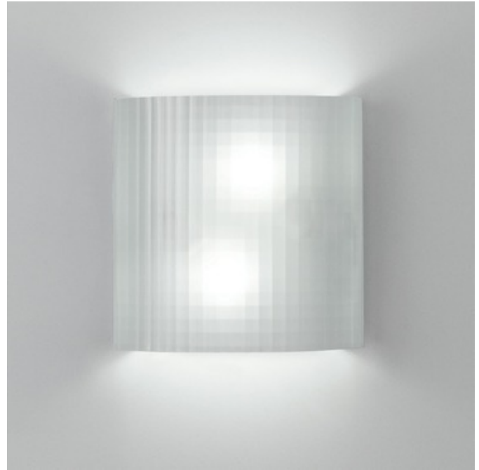
Shown in: White / Clear Grid

The Facet Wall Light features a Clear grid sanded textured glass or White sanded textured glass diffuser with a White powder-coated steel backplate. Both diffusers have a slightly green tint. Mounts to standard electrical junction box. 12 inch width x 12 inch height x 4 inch depth. UL listed. ADA compliant.