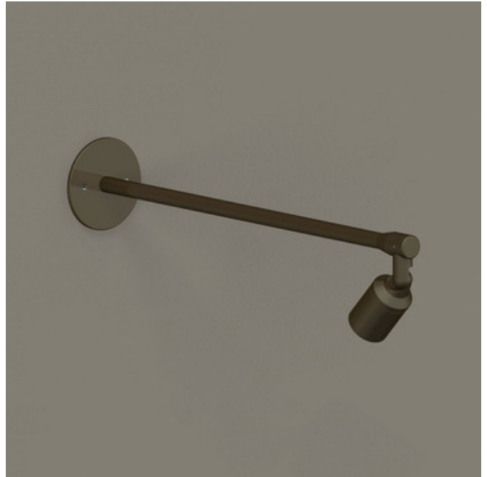
Shown in: Aluminum / Bronze

HL-716 MR16 Sign Light features a 24 inch arm with 90 degree adjustability. Perfect for illumination of signs, buildings and open spaces. Available in a machined aluminum. Finish available in satin aluminum, black, bronze, or white. ETL listed. Suitable for wet/damp/dry locations. Requires a 12V AC output transformer, sold separately.