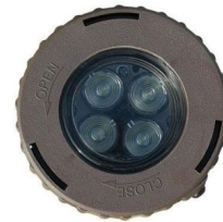
Shown in bronze

LAMP LIFE . . . . . 25000 hours BEAM ANGLE . . . . . 25° LAMP COLOR . . . . . 3000K LUMENS/WATT . . . . . 65.71 LUMINOUS FLUX . . . . . 460 lumens