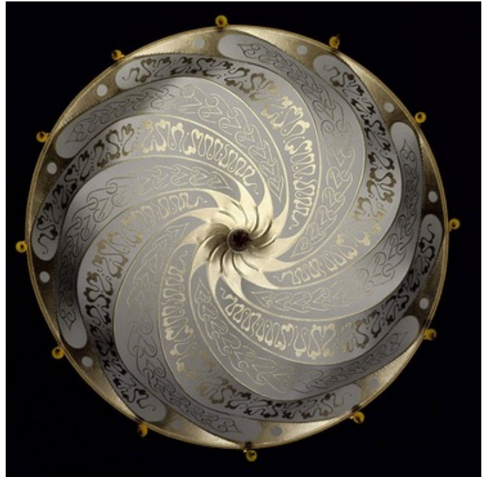
Shown in: Brass / Sage Grey Serpentine

The Scudo Saraceno Silk Pendant is inspired by the Saraceno Shield from Medieval times. The delicate silk is complemented by striking details including Murano beads with a brass structure finish and a dark brown canopy in a stylistic Turkish -Venetian motif. Patterns available in Classic or Serpentine in Gold, Salmon, Sage Grey, Ivory or Light Blue, or Plain in Ivory in three sizes. Made in Italy. Classic pattern features a small red line in pattern. Note: Overall height is not adjustable and must be specified to order. Small Minimum / Maximum height: 33 / 62.63 in. Medium Minimum / Maximum height: 35.63 / 63.13 in. Large Minimum / Maximum height: 37.63 / 64.38 in.