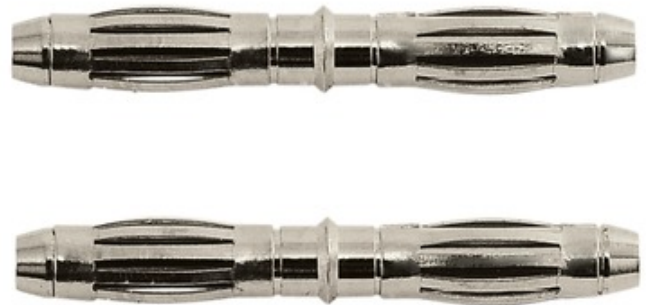
Shown in: Satin Nickel

Monorail straight conductive connectors physically, and electrically, join two pieces of Monorail together. One pair is included with each piece of Monorail. Purchase separately if rail is to be cut and rejoined. Finish available in satin nickel or antique bronze. ETL listed.