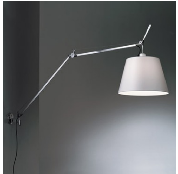
Shown in: Aluminum / Grey Shade

Tolomeo Mega Wall Mount with Diffuser features a fully adjustable, articulated arm with a J bracket for wall mounting on a junction box. Available in an Aluminum body finish with a Parchment, Silver Fiber, or Black shade, or a Black body finish with a Black shade. Available with a 12, 14 or 17 inch diameter shade. 12 Inch: 12.6 inch diameter shade x 43.3 inch height x 38.2 inch depth x 70.9 inch extended arm length. 14 Inch: 14.2 inch diameter shade x 43.3 inch height x 39.4 inch depth x 71.7 inch extended arm length. 17 Inch: 16.5 inch diameter shade x 43.3 inch height x 40.1 inch depth x 72.8 inch extended arm length. One 150 watt 120 volt medium base A21 type medium base incandescent lamp is required, but not included. Dimmer located on cord. Directional general light distribution. UL listed.