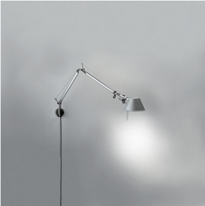
Shown in: Aluminum

Tolomeo Micro Plug In Wall Light with S Bracket (cord and plug) features a fully articulated arm and body structure in extruded natural anodized aluminum. Joints and tension control knobs in polished die-cast aluminum and tension cables in stainless steel. Diffuser in anodized aluminum. Type S suitable for wall surface mounting with cord and plug. Diffuser is tiltable and is 360 degree rotatable on lampholder. On/off switch. Two lamping options. INC: One 60 watt max 120 volt G16.5 candelabra base bulb is required, but not included. LED: Integrated 5 watt 120 volt LED light source. 4.4 inch shade width x 16.1 inch height x 19.3 inch depth. UL listed.