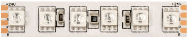
Shown in: Aluminum

SS6 RGB Snap & Light Soft Strip provides dynamic color effects with red, green, blue color temperature. This color changing strip offers chromacity quality providing a balanced output across the color gamut, allowing the creation of millions of colors.Sold in 1 foot increments at 3 watts (2.6 watts) per foot up to 36 feet or 5 watts (4.4 watts) per foot up to 20 feet with cutting increments every 3 inches. Soft Strip is compatible with solderless Snap & Light Connectors for making turns and custom configurations, sold separately. Self-adhering Soft Strip mounts to most smooth finished surfaces with industrial strength 3M tape (provided on back of strip). Some unfinished surfaces may require screw-in mounting clips (SS-MCL), sold separately.Soft Strip requires a 24 volt DC power supply with integrated RGB DMX driver. DMX power supply must be used with PureEdge CDMX1- RGBW controller.Note: Light Channel, RGB power supply, controller, power feed, and optional accessories sold separately.