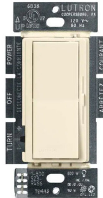
Shown in: Gloss Almond

The Diva LED+ Dimmer features a large paddle switch and linear-slide dimmer that can be pre-set. Single pole/3-way. Available in satin and gloss finishes. Designed for use with dimmable compact fluorescent with integrated ballast or dimmable LED with integrated driver up to 150 watts, 120 volt incandescent and halogen up to 600 watts, mixed bulb type per multigang and mix bulb type ratings table, or 250 watt Lutron LTEA Hi-lume 1% forward phase LED driver (max 6 drivers). Note: Claro designer style wall plates sold separately.