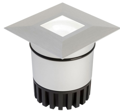
Shown in satin aluminum