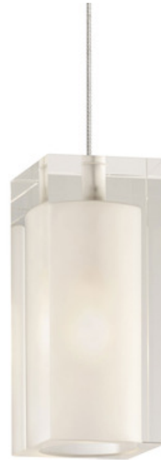
Shown in: Satin Nickel / Frost

Solitude Freejack Pendant features a rectangular pressed glass shade with classic geometric design. Compatible for use with 1-circuit Monorail track system or Freejack canopy. Halogen: Includes one 12 volt, 35 watt halogen bi-pin lamp. LED: Includes one 12 volt, 6 watt replaceable 90CRI 3000K LED module. Supplied with six feet of field cuttable suspension cable and a Freejack connector. Freejack canopy required when used as a monopoint, sold separately. LED canopy compatible with both halogen and LED lamp options. Dimmer type dependent on system transformer (low voltage magnetic or electronic). ETL listed. Halogen option Title 20 compliant. LED option Title 20 and Title 24 compliant.