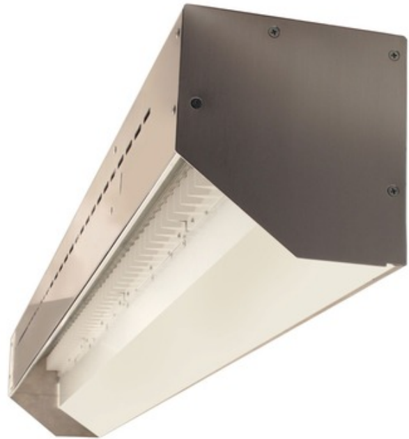
Shown in: Aluminum

The Stratus Linear Outdoor Wall Grazer is a Non-IC rated fixture designed for use in recessed cove or surface mount applications for new residential, new commercial, and remodel. Lights textured walls up to 30 feet high. Available in 1 foot and 4 foot lengths in 3000K or 4200K color temperature with field replaceable LED. Link multiple Stratus fixtures to create long runs. Included components: Wall mounting bracket, housing, joiner bracket, reflector, LED panel, one internal 0-10V power supply, and louver. Note: End caps sold separately. Feed fixture with 120-277VAC. Dimmable with a 0-10V dimmer, sold separately. Suitable for outdoor damp or covered locations. Product is built to order.