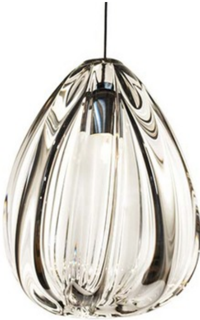
Shown in: Antique Bronze / Clear

The Small Thick Barnacle FJ Pendant focuses on the way glass forms and light play with each other. Hand rendered texture creates unique projected patterns on the urchin and barnacle lights. These low voltage fixtures can be hung singularly from a monopoint canopy or as a grouping for a statement piece. Hand blown and shaped in lead free crystal. No molds are used, and each glass shape is unique. Canopy required and sold separately. Includes male FreeJack connector.