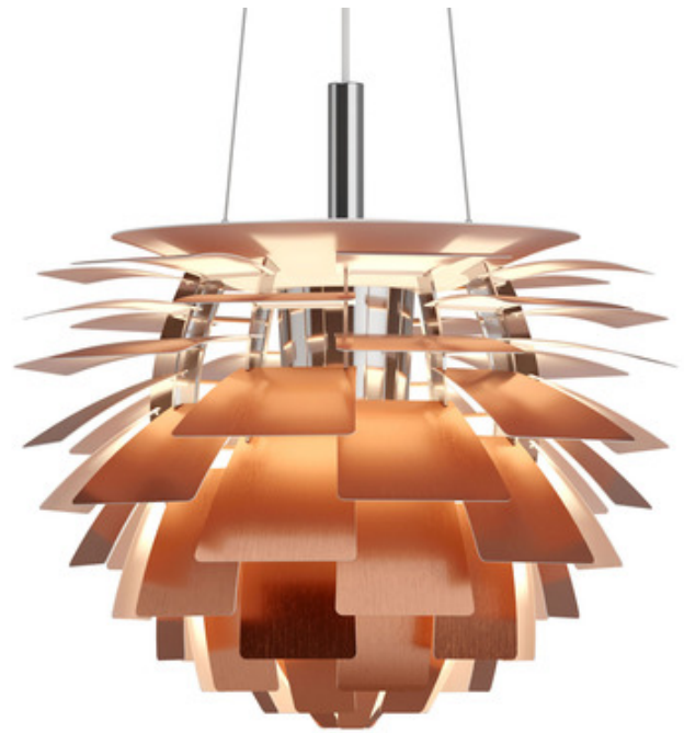
Shown in: Copper

The PH Artichoke Pendant is an original midcentury icon. Created in 1958 by Danish design genius Poul Hennigsen, the PH Artichoke is a glare-free luminaire featuring laser-cut metal leaves, which give it the sharp smooth lines so indicative of modern design. The leaves shield the light source and redirect and reflect the light onto the underlying leaves creating a stunningly unique illumination.