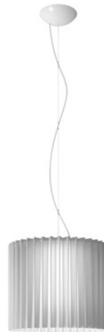
Shown in: White / White

The Skirt takes inspiration from the world of fashion, in particular from the garment of the same name. Its lampshade is made from recycled materials with sound-absorbing properties which allow it to reduce noise by up to 53%. White internal diffuser included. White canopy and cord. Phase cut dimming on option with included E26 base bulb. Sound Performance: Equivalent Absorption Area which reaches a maximum of 3.55.