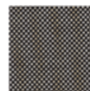
black net cover fabric (optional)