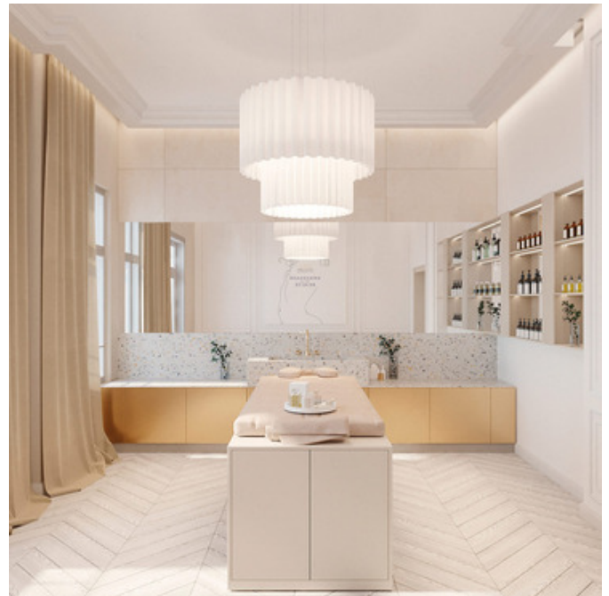
Shown in: White / White

The Skirt takes inspiration from the world of fashion, in particular from the garment of the same name. Its lampshade is made from recycled plastic with sound-absorbing properties which allow it to reduce noise by up to 53%. White internal diffuser included. White canopy and cord. Dimming: Integrated LED Module: Includes 120-277V driver with 0-10V dimming E26 Base Bulb Included: Phase cut dimming E26 Base Bulb Not Included: Standard 120V with dimmable LED bulbs Sound Performance: Equivalent Absorption Area which reaches a maximum of 3.55.