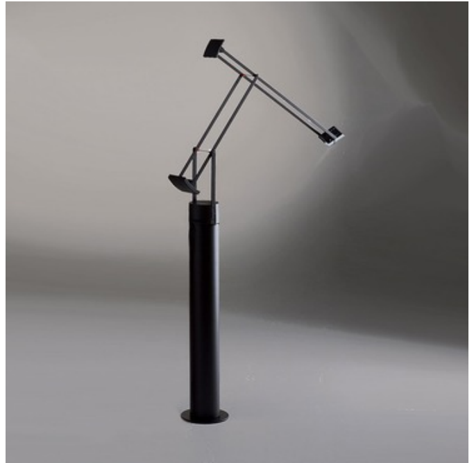
Shown in: Black / Black

Tizio 35 Floor Lamp features a floor support in lacquered steel with snap in adapter kit in molded thermoplastic. Incorporated low voltage transformer and two intensity on/off switch. Fully adjustable arms in anti corrosion treated aluminum. Arm spacer bars in chromed steel with red, molded thermoplastic insulators and counterweights in zinc alloy. Adjustable diffuser in die-cast aluminum with inner high efficiency reflector in anodized aluminum with UV protective glass. 360 degree rotatable base. Finish for lamp with floor support available in Black only. Floor support is 27 9/16 inches high x 3 15/16 inch diameter. Tizio 35 lamp is 22 inches high x 25 5/8 inches deep x 39.25 inch maximum arm extension. Includes one 35 watt GY6.35 halogen lamp. UL listed.