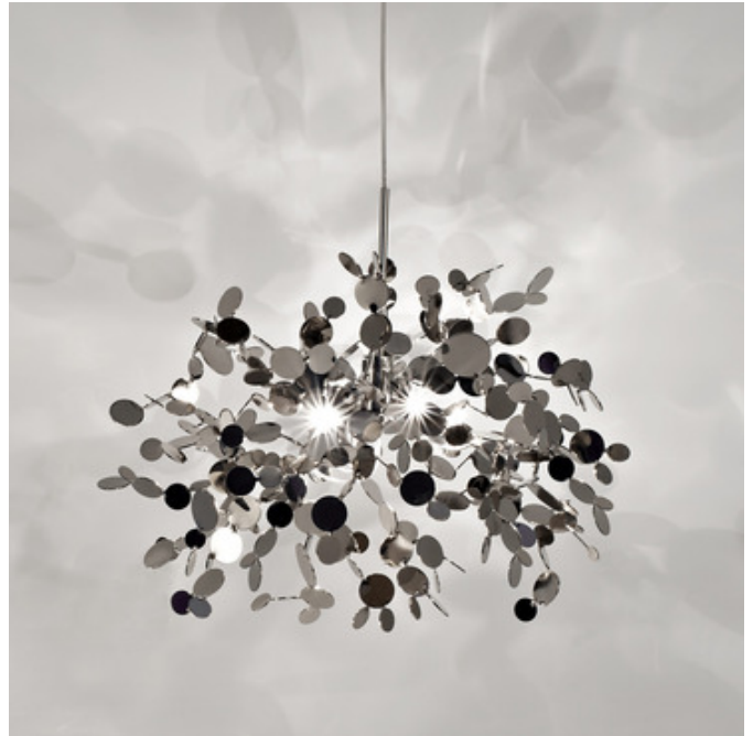
Shown in: Nickel / Stainless Steel

The Argent Pendant creates a shimmering cloud of metal discs that have been meticulously shaped by hand by Terzani craftsmen into clusters of beauty. Once lit, the multiple, angled surfaces of the discs emanate a soft shimmering glow.