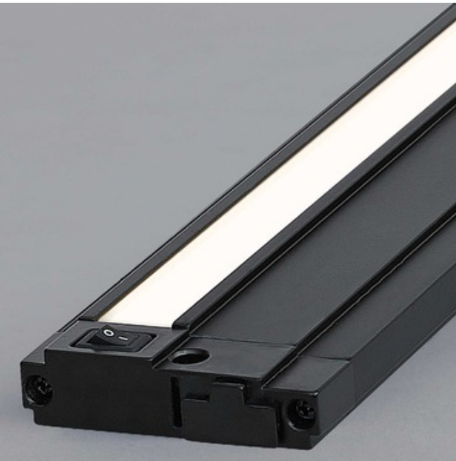
Shown in: Black

The Unilume Slimline 90CRI Undercabinet Light utilizes the tight clustered blue LEDs, a 98 percent reflective mixing chamber and an Internatix ChromaLit remote phosphor lens. The result is consistent illumination with ultra high efficiency-all in a housing that is less than 3/4 of an inch deep. Finish in Black or White. Available in four sizes. Available in choice of Very Warm White 2700K, Warm White 3000K, or Neutral White 3500K color temperature with 90CRI. 50,000 hour average lamp life. Features an integrated LED driver that makes installation easy and allows smooth dimming down to 15 percent using an electronic low voltage dimmer. Each unit includes an integrated on/off switch. ETL listed. Suitable for damp locations. Extra Small: Includes 4 watts LED, 240 lumens. 7.2 inch length x 2.8 inch depth x .7 inch height. Small: Includes 8.5 watts LED, 527 lumens. 13.2 inch length x 2.8 inch depth x .7 inch height. Medium: Includes 10.5 watts LED, 693 lumens. 19.2 inch length x 2.8 inch depth x .7 inch height. Large: Includes 18 watt LED, 1224 lumens. 31.3 inch length x 2.8 inch depth x .7 inch height. 5 year warranty. Title 24 compliant. ETL listed. Required and optional accessory items available, sold separately.