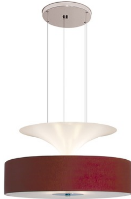
Shown in: Chrome / Red

The Air Wave H5+2 suspension lamp is available in two sizes and features a circular fabric shade available in Black, Red, Beige, White or Brown. Metal canopy available in Matt Nickel, Brilliant Brass, Satin Brass, Chrome, Bronze, Black or White finish. Smaller size H5 2 is 23.6 inches in diameter x 12.8 inches high and requires five 60 watt 120V A19 medium base incandescent plus two 150 watt R7s 120V halogen for uplight (lamps not included). Larger size XL H5 2 is 31.5 inches in diameter x 12.8 inches high and requires five 60 watt 120V A19 medium base incandescent plus two 150 watt R7s 120V halogen uplight (lamps not included).