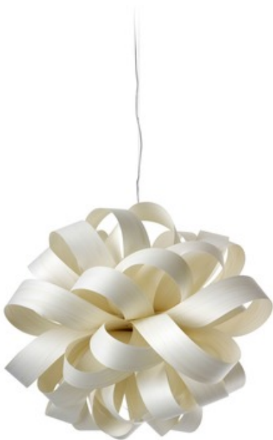
Shown in: Brushed Nickel / Ivory White Wood

Agatha Ball Pendant has an arresting and dramatic demeanour making this sculptural, physical and versatile. Agatha fills the room with her ambient glow and appealing body. The elegant interlacing whorls of handmade wood veneer strips spring concentrically from its center, their mass blossoming and flourishing. Available in Ivory White, Natural Beech, Orange, Yellow, or Pale Rose wood veneer with Brushed Nickel canopy. Supplied with 8 foot steel cable and transparent electrical cord. UL listed. Dimmable with a Triac or 0-10V dimmer.