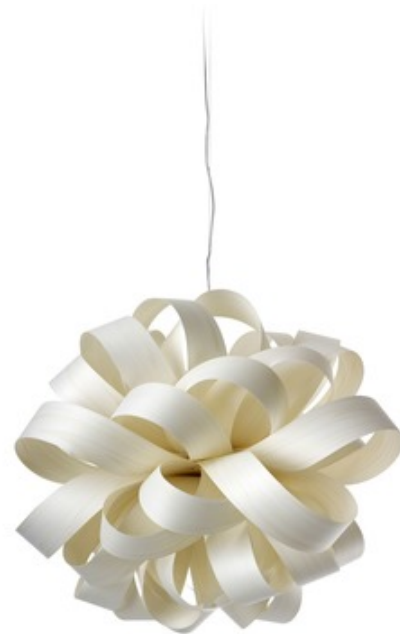
Shown in: Brushed Nickel / Ivory White

Agatha Ball Pendant has an arresting and dramatic demeanour making this sculptural, physical and versatile. Agatha fills the room with her ambient glow and appealing body. The elegant interlacing whorls of handmade wood veneer strips spring concentrically from its center, their mass blossoming and flourishing. Available in Ivory White, Natural Beech, Orange, Yellow, or Pale Rose wood veneer with Brushed Nickel canopy. Supplied with 8 foot steel cable and transparent electrical cord. UL listed. Dimmable with a Triac or 0-10V dimmer.