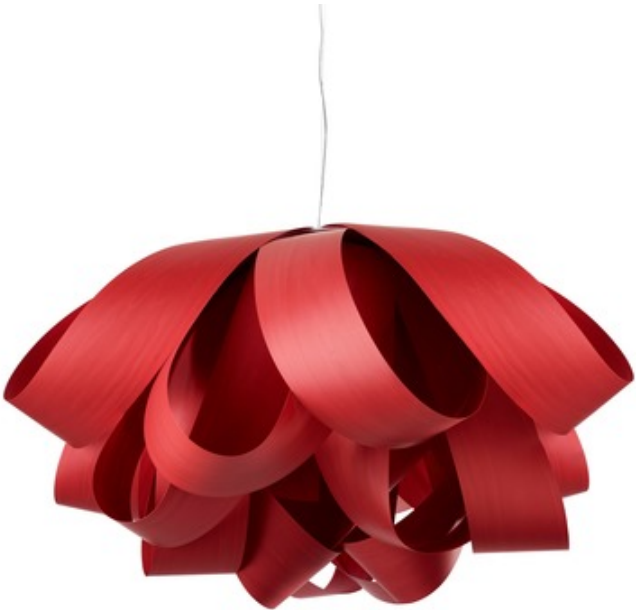
Shown in: Brushed Nickel / Red Wood

The Agatha Pendant, designed by Luis Eslava, has an arresting and dramatic demeanor making this sculptural, physical and versatile. Agatha fills the room with her ambient glow and appealing body. The elegant interlacing whorls of handmade wood veneer strips spring concentrically from its center, their mass blossoming and flourishing. Available in a variety of colors with Brushed Nickel canopy finish. Supplied with 8 foot suspension steel cable and transparent electrical cord. Integrated LED module option dimmable with a Triac or 0-10V dimmer.