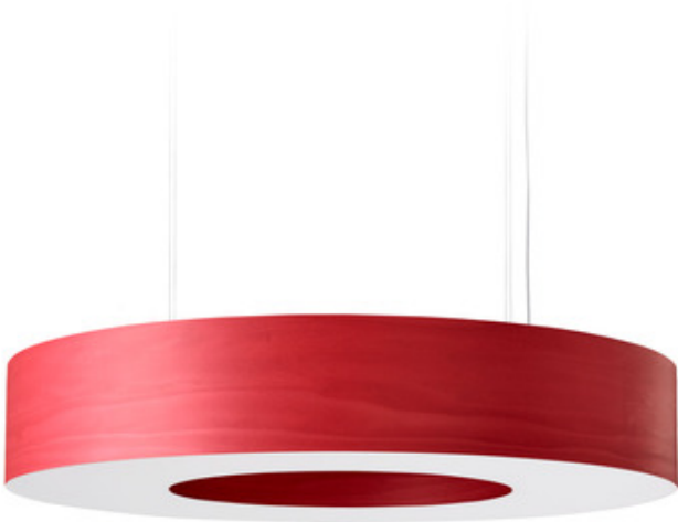
Shown in: Brushed Nickel / Red Wood

The Saturnia Pendant is reminiscent of Saturn's system of planetary rings. A truly handsome and enchanting light, its form is one that captivates the eye: similar to the way in which we gaze wondrously at stars in the night sky. Saturnia balances both indirect and direct lighting with aplomb. Its circular wood veneer spreads warm light outwards, while its Plexiglas diffuser provides the perfect direct light necessary for task-oriented jobs and for social or work environments. Supplied with 8 foot steel cables, a transparent electrical cable, and a Brushed Nickel canopy.